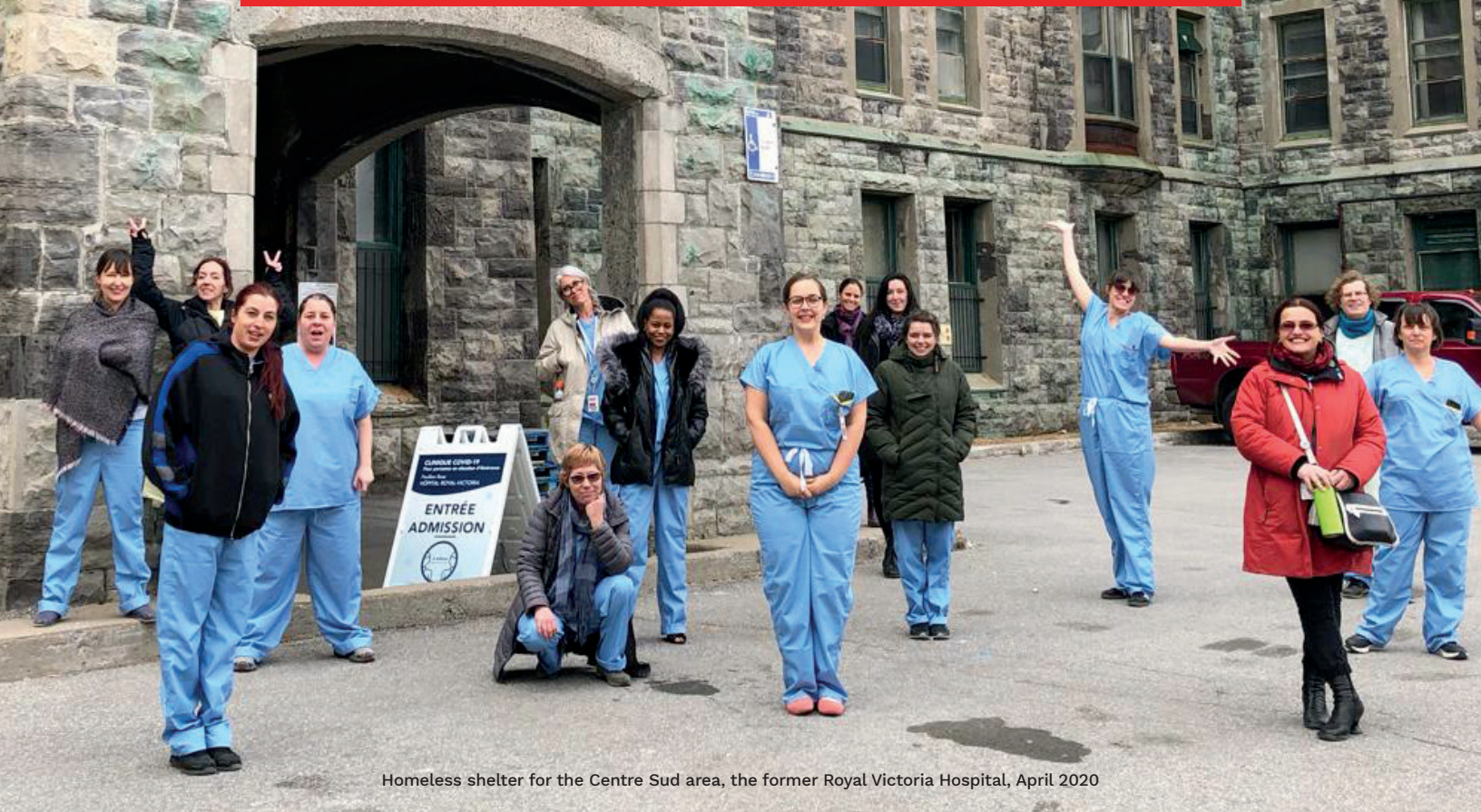
Homeless shelter for the Centre Sud area, the former Royal Victoria Hospital, April 2020

Thank you to our donors for making this $330,000 emergency fund possible